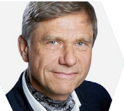
Dr. Hermann Hauser

"I was blown away! I am so impressed that there are so many good companies now."